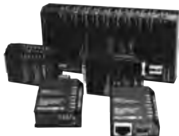
AX050, 70 and 80 Transceivers and AX-509 Ethernet Hub

The AX-509 Ethernet Hub has an AUI port which accepts UTP, Fiber Optic or BNC transceivers. Specified for use by many U.S. Government Agencies. Includes a 110v/12v power supply.