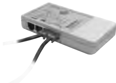
AX-110BT Realtime 10/100 Base-TX Ethernet Network Test Unit

The AX-110BT Realtime 10/100 Base-TX Ethernet Network Test Unit is a cost effective way to quickly determine a network's operating condition. Plug the unit's patch cord into the tester, then into any open RJ-45 jack in an office, cubicle or conference room. Immediately see if the jack is a live network node capable of either 100 Mb/s or 10 Mb/s. Next check patch cord continuity and polarity. Connect the downlink to a PC to check NIC card link, speed and full or half duplex capabilities. Connect the uplink to a hub or switch port to verify link and speed.